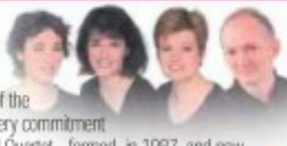
Sponsored by Friends of the Shropshire Music Trust