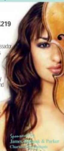
Sponsored by James, Graham & Parker Chartered Accountants